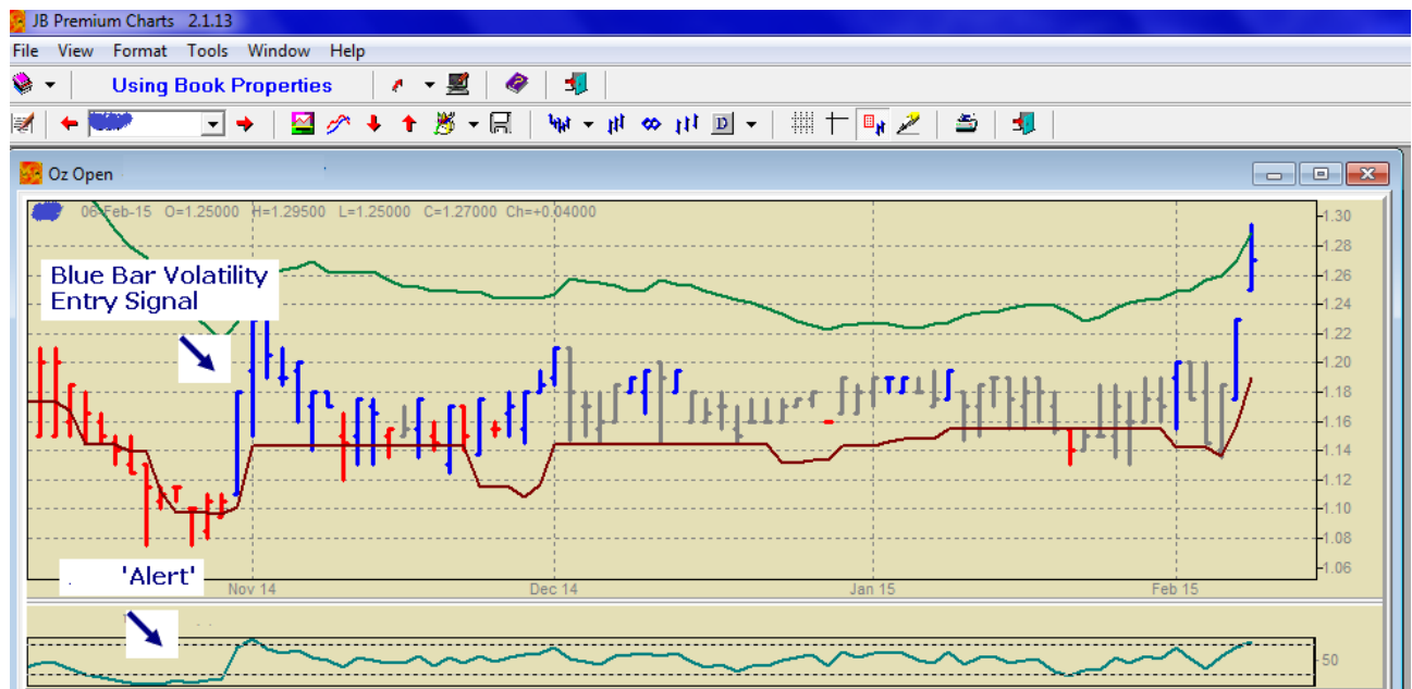
Stock #3 Daily Chart

Action: Holding position with Trailing Stop at $1.19.