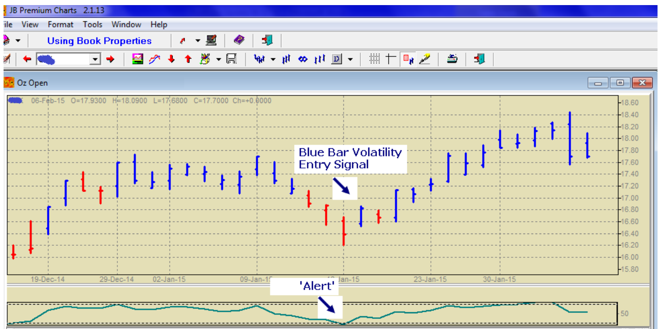
Stock #1 Daily Chart

Action: Holding position with Initial Stop at $16.07.